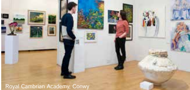
Royal Cambrian Academy, Conwy