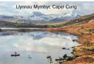
Llynau Mymbyr, Capel Curig

Nearby Gwydir Castle and Gwydir Uchaf Chapel reveal more of the area's eventful past. Llanrwst is bordered by the popular Gwydir Forest Park, a lovely area latticed with numerous trails for all abilities. These waymarked paths take in everything from hidden mountain lakes to industrial heritage, scenic viewpoints to local history and the legend of Dafydd ap Siencyn, the forest's own 'Robin Hood'.