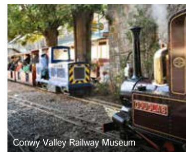
Conwy Valley Railway Museum

Conwy Castle was built for English King Edward I between 1283 and 1287 and is now a UNESCO World Heritage Site. Climb one of the eight massive towers for the best views of our beautiful estuary and look out for the castle after dark, when it's all lit up. It's magical. Open daily all year except 24, 25, 26 Dec and 1 Jan. See website for opening hours.