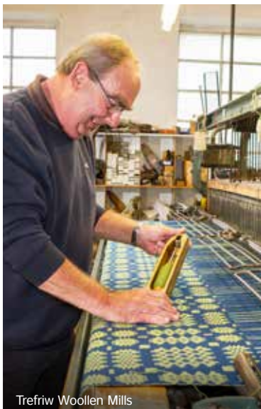
Trefriw Woollen Mills

Conwy based gallery showcases the work of around twenty local designer/makers and includes a wide range of ceramic work – from homeware to collectors' pieces and sculpture.