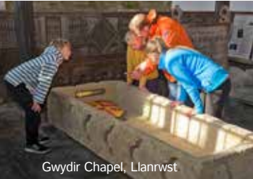
Gwydir Chapel, Llanrwst

Considered by many to be the most attractive village in the county, Rowen nestles at the foot of the Tal-y-Fan Mountain. Front gardens of quaint stone cottages burst with flowers in the spring and summer and there's a lovely country pub, perfect for a pit-stop whilst exploring the network of trails and paths.