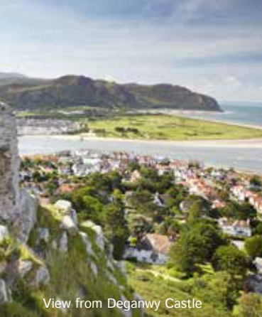
View from Deganwy Castle