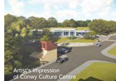
Artist's impression of Conwy Culture Centre