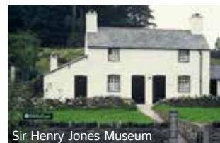
Sir Henry Jones Museum

This 19th century workman's cottage was the birthplace of Sir Henry Jones (1852-1922), who transformed education in Wales. This fascinating museum depicts Welsh rural life during the Victorian era and is open from 27 May to 30 Sep - Thurs, Fri, Sat and Bank Holidays. See website for 2019 opening times.